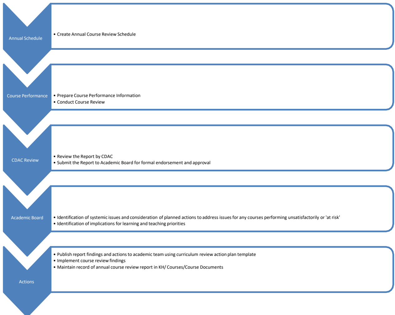
Figure 1: Course Review Process